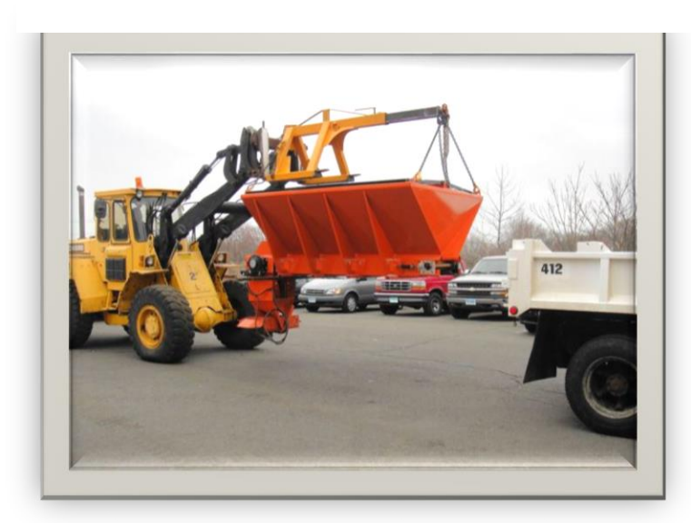
Gantry Lifting Device