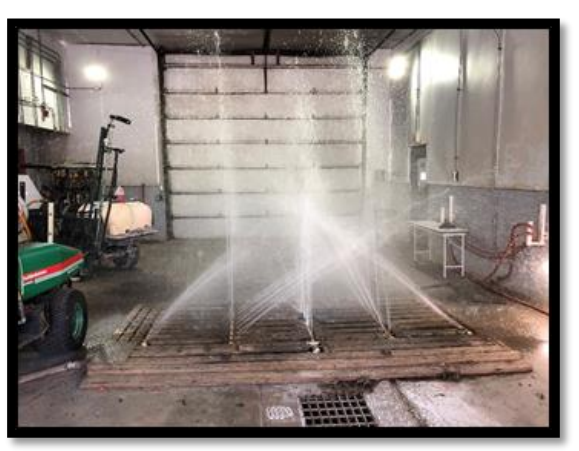
Under Carriage Washer